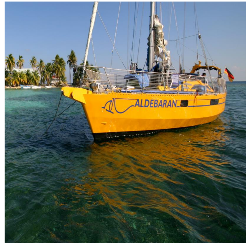
ALDEBARAN – Research & Broadcast / ocean ambassador since 1992