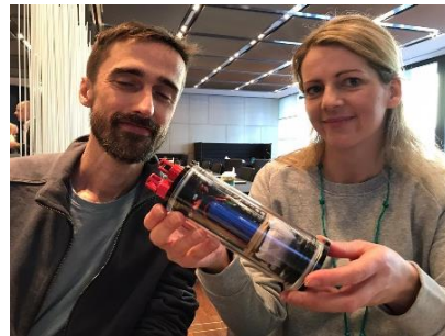
Citizen Science – German Sailing Association and int. Dive Associations