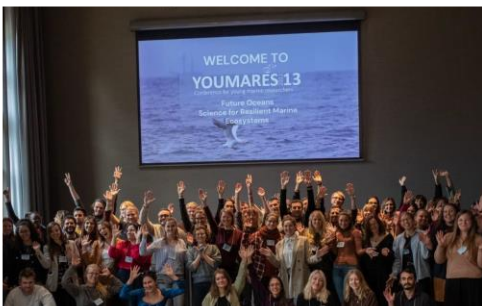
YOUARES Young Researchers conference - German Society for marine Research