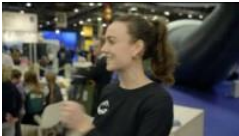
love your ocean 2023 https://youtu.be/eyhfU39N_7I