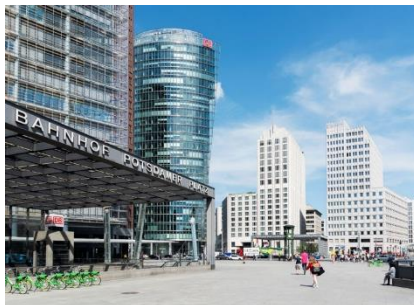
Ocean Festival in Berlin August 2023.