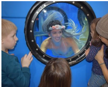
„love your ocean“ sustainability initiative at boot Düsseldorf