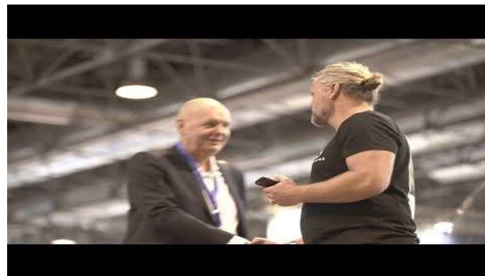
Water sports and environmental protection- love your ocean https://youtu.be/_rFJtSH2-D8