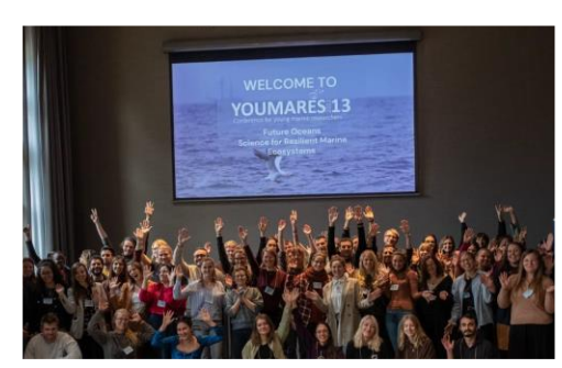
YOUMARES Young Researchers conference - German Society for marine Research