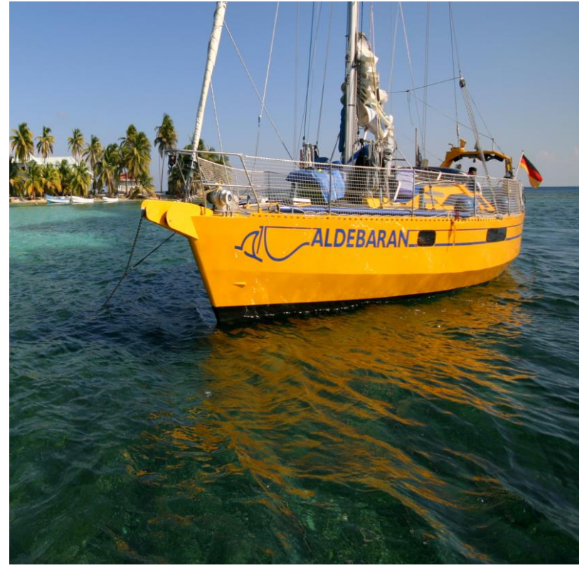
ALDEBARAN – Research & Broadcast / ocean ambassador since 1992