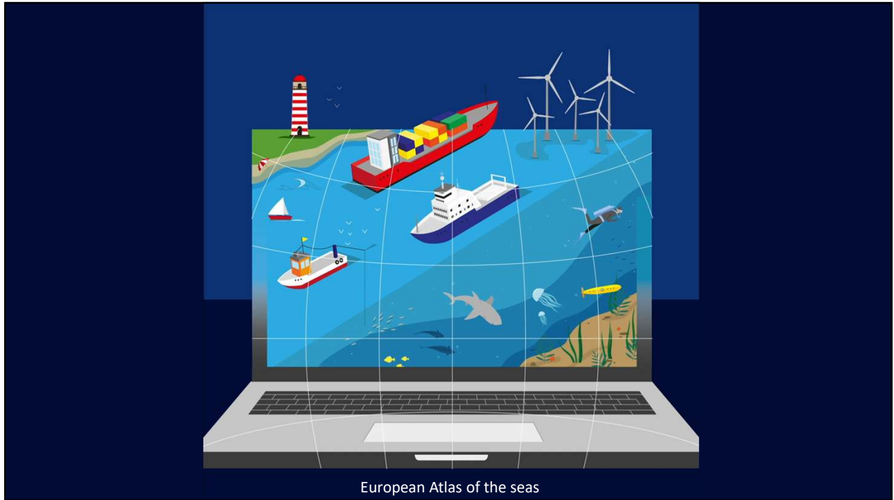
European Atlas of the seas