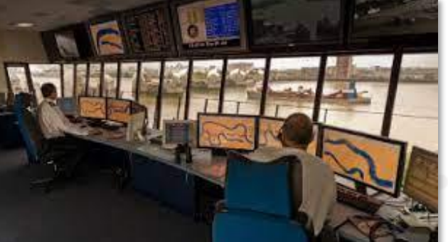
New Vessel Traffic Services