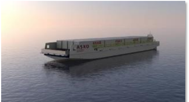
Autonomous vessels for transport, wind farms/off-shore service, inland waterways, automatic tugs