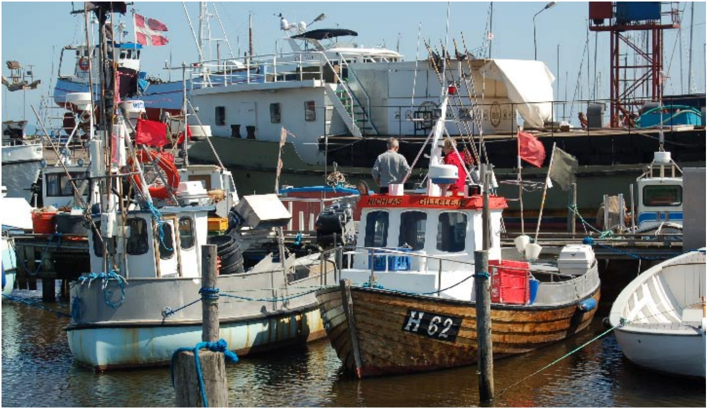
With the new regulations vessel owners could also better adjust their fishing activity to the type of vessel and the catching methods.

management track. The Danish Technical University will publish the results at the end of August and the government has invited EU ministers to discuss the perspectives at a conference to be held on 8 October. The Danish government believe the catch quota approach to have a universal relevance and a number of working papers and the conference programme are open to the public at www.fvm.dk/yieldoffish