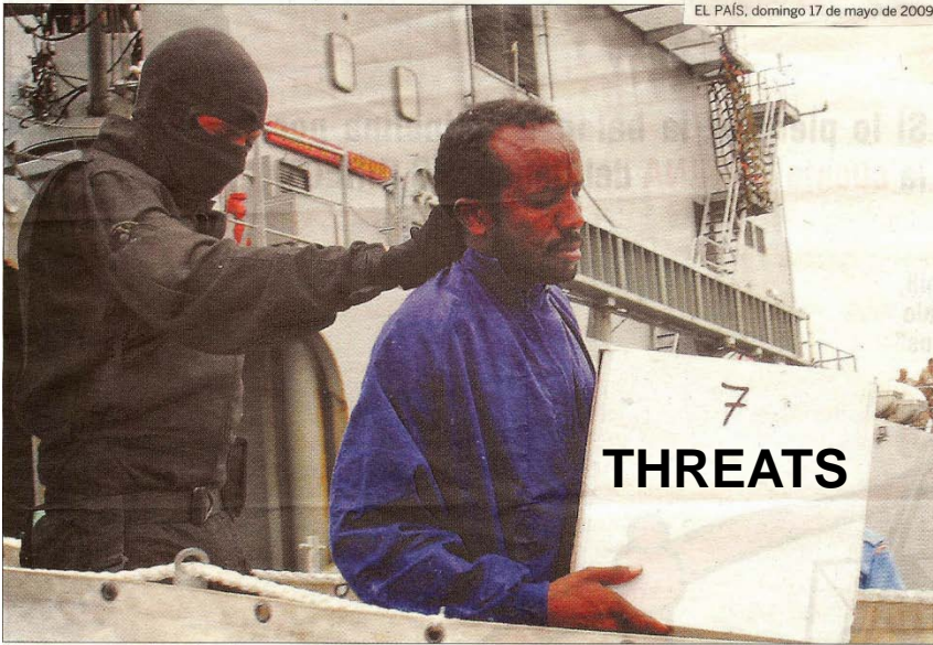
EL PAÍS, domingo 17 de mayo de 2009