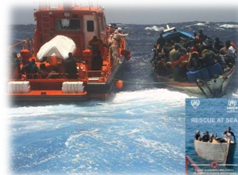
RESCUE AT SEA