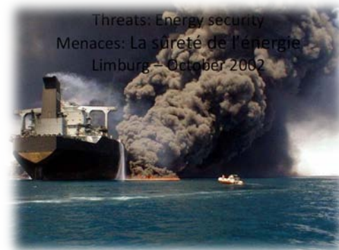
Threats: Energy security Menaces: La sûreté de l'énergie Limburg - October 2002