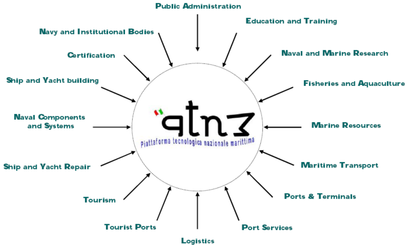
PTNM – Italian National Maritime Technology Platform