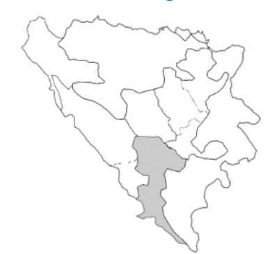
Figure 1 - Localisation of Herzegovina-Neretva Canton