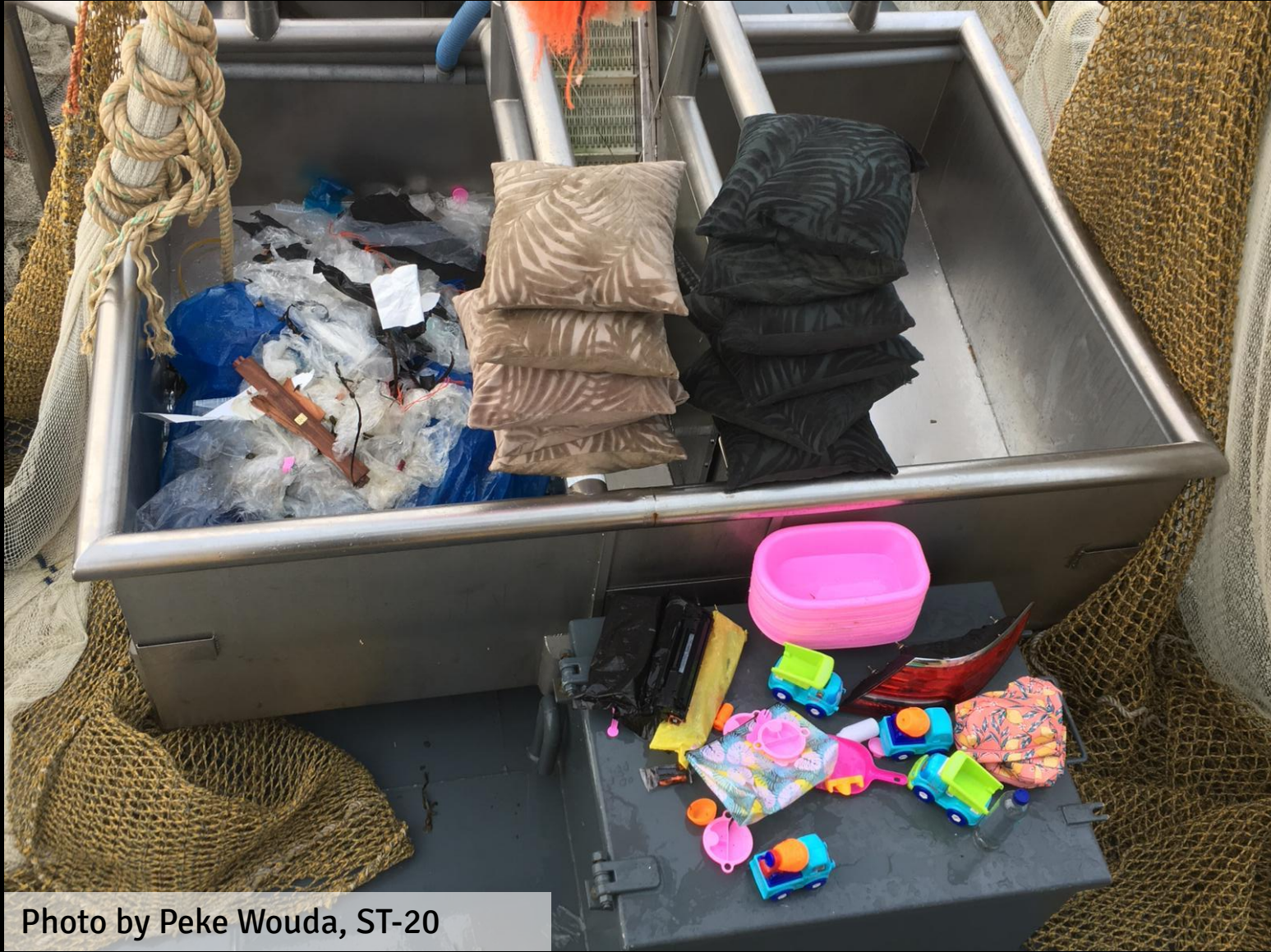
ST-20

The catch varied from pillows, soap dispensers and toys...