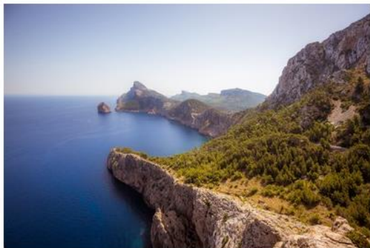
Mallorca, Llubí, Spain