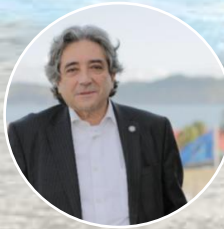
Ricardo Serrão Santos , Minister of Maritime Affairs, Portugal