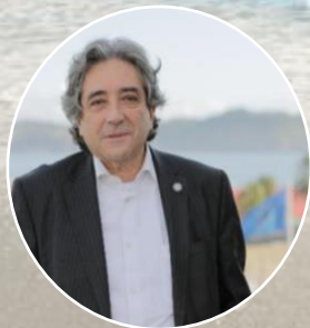
Ricardo Serrão Santos , Minister of Maritime Affairs, Portugal