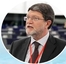
Tonino Picula , chair of the Searica Intergroup, European Parliament