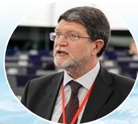
Tonino Picula , chair of the Searica Intergroup, European Parliament