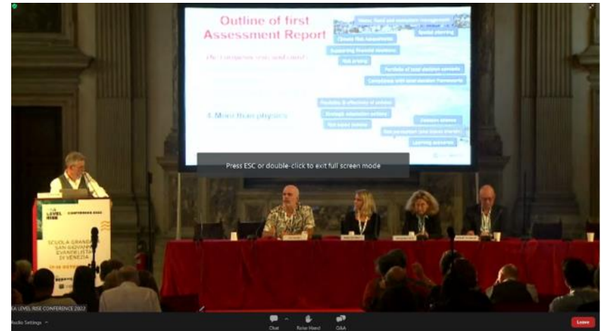
Sea Level Rise Conference in Venice, Italy