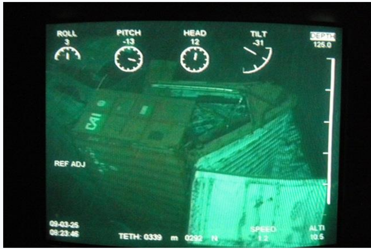
Lost containers photographed at a depth of 126 metres