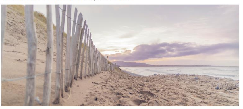
2<sup>nd</sup> EMODnet-Copernicus Marine Thematic Workshop on Coastal Issues

2nd EMODnet-Copernicus Marine Thematic Workshop on Coastal Issue