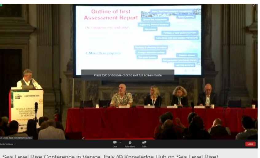
Sea Level Rise Conference in Venice, Italy